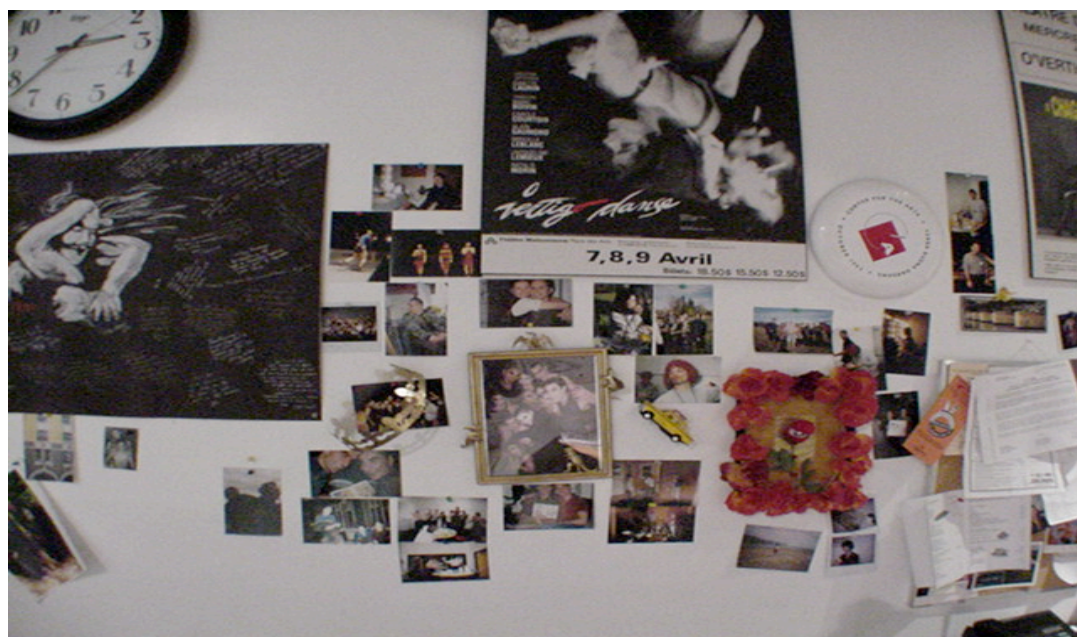
Photo 16 : Kitchen wall with photos, objects and texts of dancers, May 24, 2000