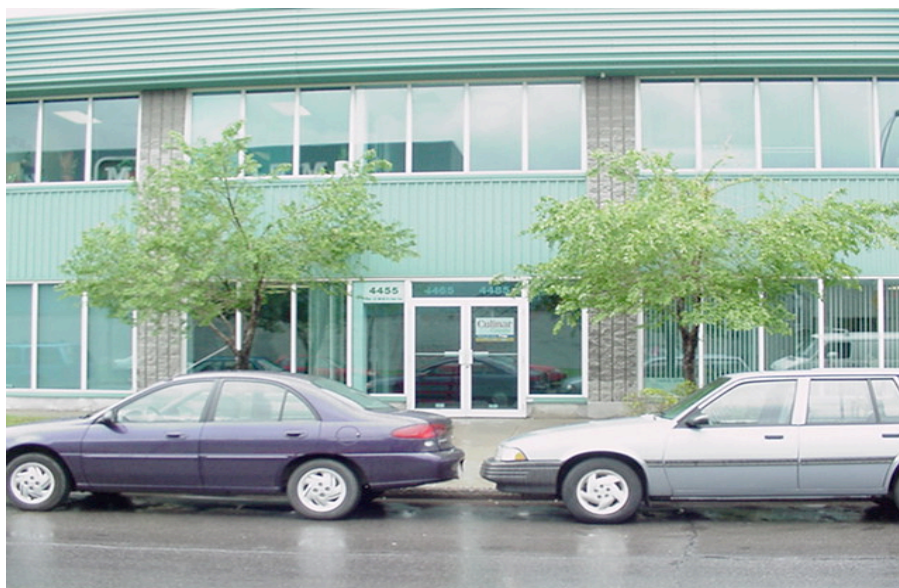
Photo 2: O Vertigo building, front view, on rue de Rouen, May 24, 2000