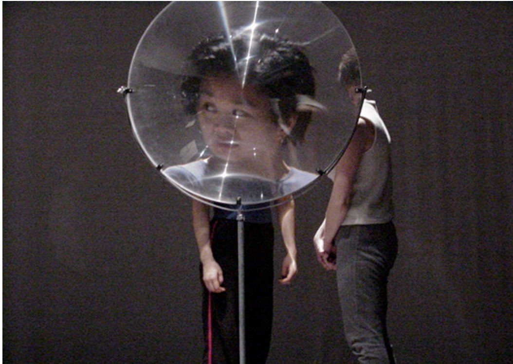
Photo 7: Long standing behind a lens in a creative process session, December 18, 2000