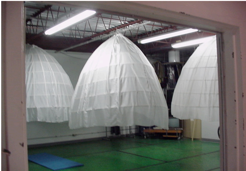
Photo 8: Silky moon-like dresses hanging in storage, December 11, 2000